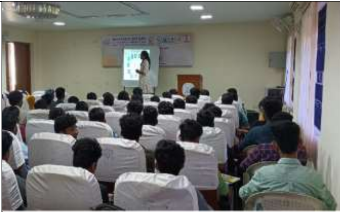
Presentation of the Speaker