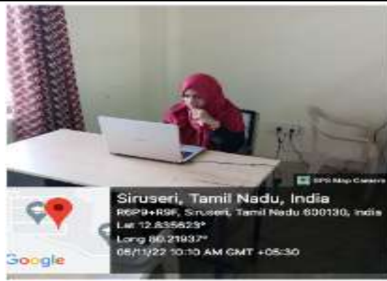
Online Mock Interview