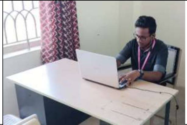
Online Mock Interview