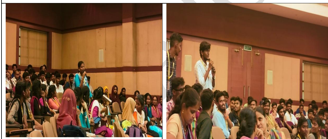
Students Interaction with the speaker