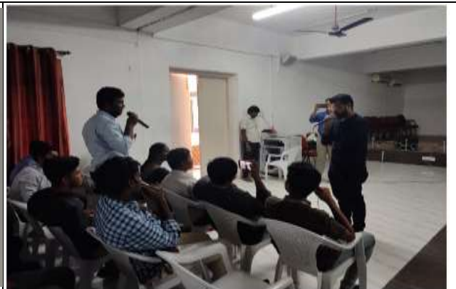
Interaction with students