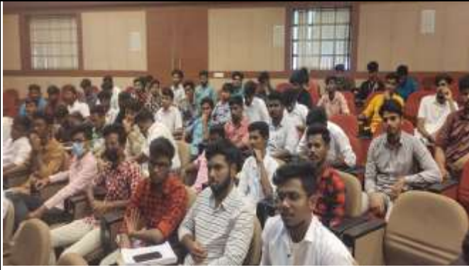
Gathering of participants