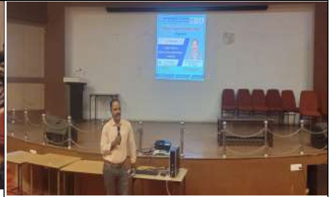
Interaction with students